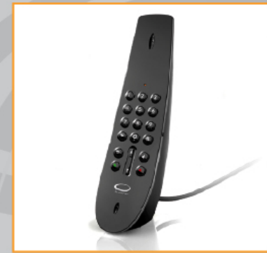
FutiroLuna – MacLife Editors Choice

Futiro delivers innovation and quality in the IT peripheral market, currently concentrating on VoIP. Employing a team of world-class designers, Futiro develop products that have lifted the bar in VoIP handset design. They produce a range of handsets including the FutiroLuna, Futiroterra and the FutiroSolo, which are functional in purpose, high quality design and innovative.